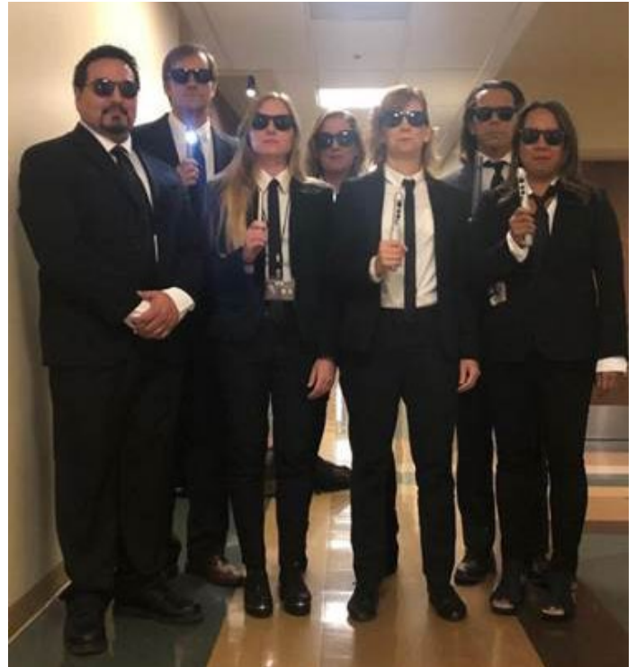
Best Group: Humanities for Men in Black